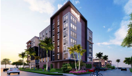
HOME 2 SUITES - PLANTATION