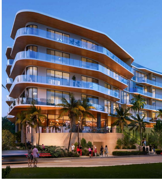
MOON RESIDENCES - HOLLYWOOD, FL