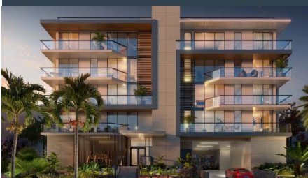
SERENE RESIDENCES - FORT LAUDERDALE