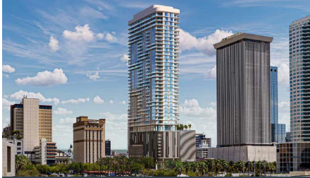
ONE TAMPA - TAMPA, FL