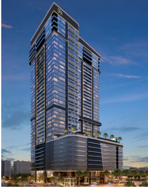
ORA HOTEL & RESIDENCES - TAMPA, FL

Adache Perspective is a periodic corporate newsletter published by Adache Group Architects to inform their clients, prospective Clients, and friends of their current architectural and interior design projects.