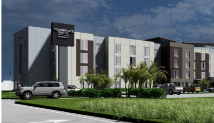
TOWNE PLACE SUITES - CLEWISTON