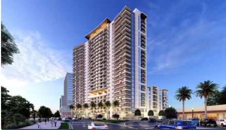
BREAD BUILDING - HOLLYWOOD, FL