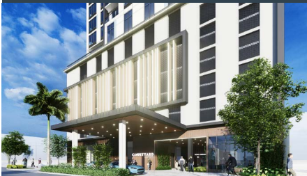
COURTYARD MARRIOTT - HOLLYWOOD, FL